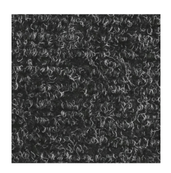
Charcoal Custom colors available with minimum volume requirements.